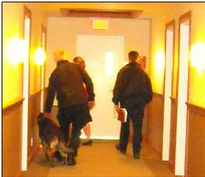
The K9 Team and evaluator Mike Chicorelli are shown to one of the suites...

The two dogs tested, Nash and Magnum passed with flying colors!