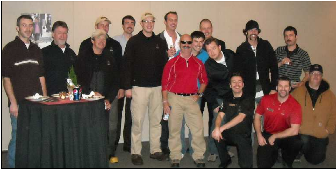
MOVEMBER ON THE MOUNTAIN 2010 TEAM!