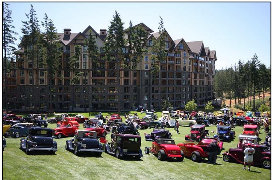
Northwest Deuce Days at Bear Mountain Resort— Not a normal sight on the course but quite impressive indeed!

It's definitely a piece of Bear Mountain History!