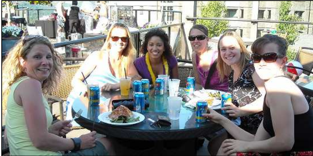
Associates from different departments took time to enjoy some fun in the sun.

Bear Mountain hosted a Summer staff party to thank all associates for their hard work during the Telus Skins Event. The summer party was held at the MAC and turned out to be a great venue for a fun evening! Thanks to everyone who helped make it happen!