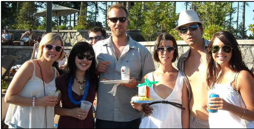
Bear Mountain Employees take some time to enjoy the pool, great food and even better company. The Pool Deck and DJ were a great combination for everyone to unwind in the evening sun.