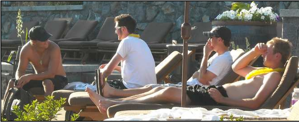
Some of the Greens Maintenance Crew soak up some late afternoon rays.