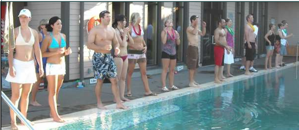
Staff line up for the water balloon toss across the pool.