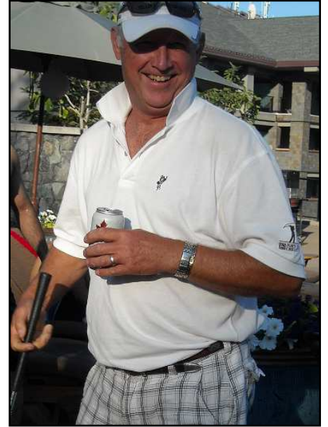
Urban (golf) was a strong contender in the golf ball bounce but was beaten in the end! Still very impressive Urban!