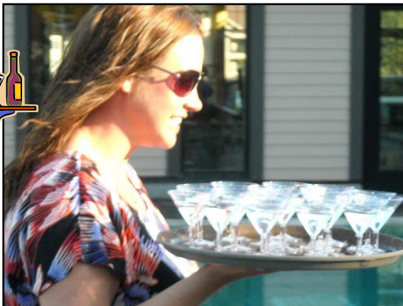
The Summer Server Race saw some F&B talent as well as strong contenders from other departments. Those teeny Martini glasses brought an extra challenge to the race!