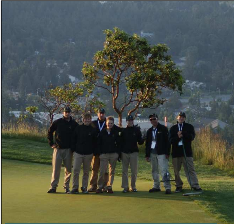
Some of our very dedicated Greens Crew! Great Job Everyone! The course has never looked better!