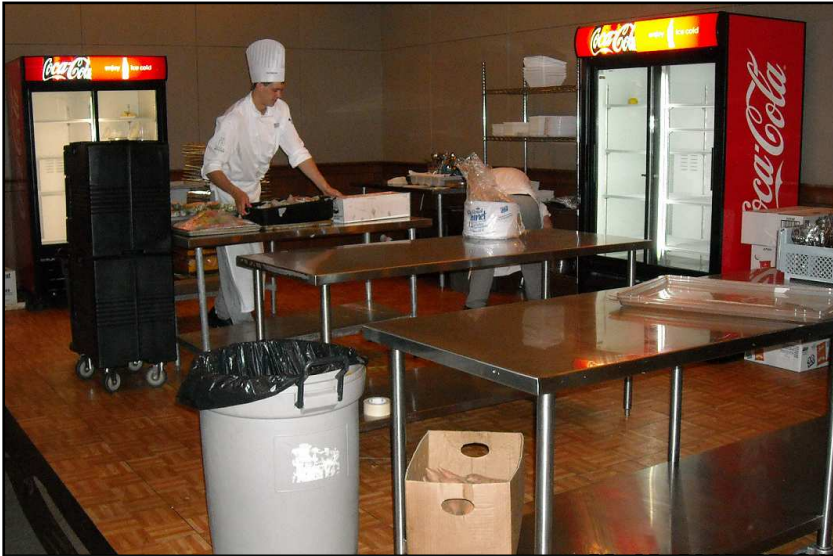
Did everyone see the temporary kitchen set up in part of the ballroom? Pretty impressive. What a creative way to increase work space!