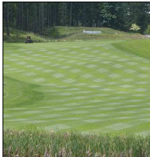
Look at that beautiful course!