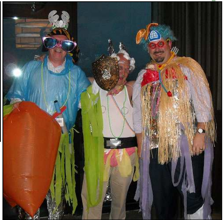
Costumes of the YEAR! Is this an indication of where we are headed for 2011?

Great job guys, this event is sure to become a regular!