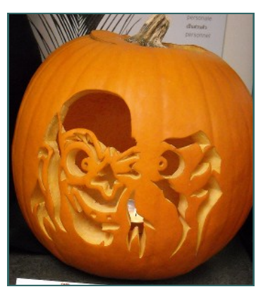
Eye of the Beholder: Naoto Arimura (Banquets)