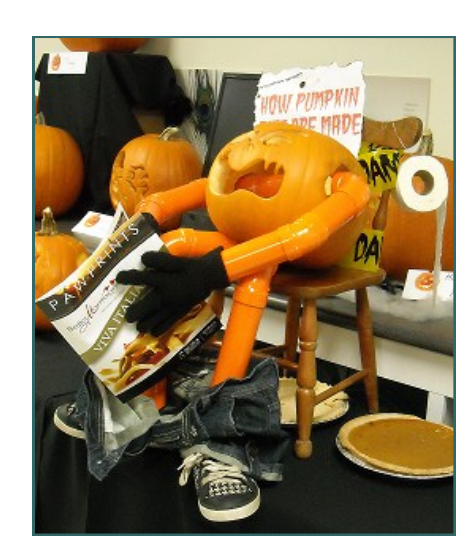
BEST IN SHOW: How Pumpkin Pies are made.