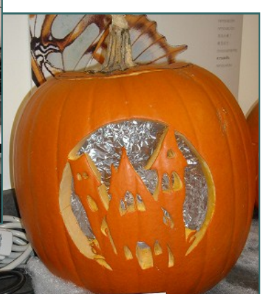
Haunted House: Corey Hawkins (Building Maintenance)