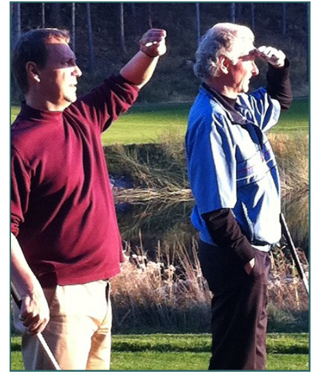
Now where did that ball go?