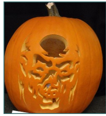
Crypt Keeper: Eriko Arimura (Banquets)