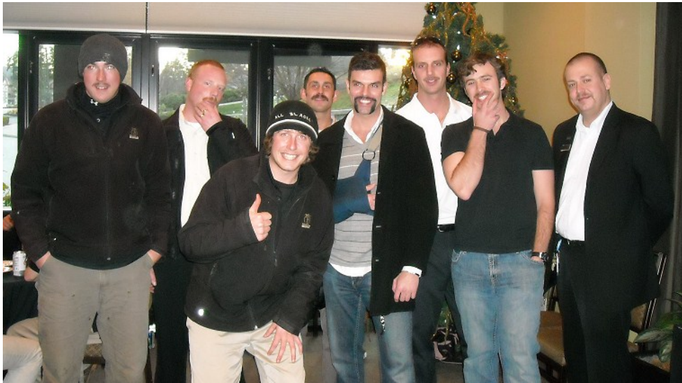
Here is a small sampling of our Mo Bros from our Movember on the Mountain Team! Talk about sophistication!

Movember on the Mountain wrapped up on November 30th with a gathering in the Gold-stream room. Our team raised just over $1000 this year and the event was yet another success with some interesting moustache creations. Here are some photos!