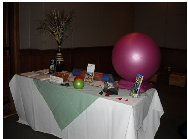
One of our many information booths. This one led the way to the cross fit demos provided by the MAC.