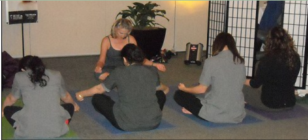
Four associates participate in a mini yoga session to relax the mind, body and spirit.

Bear Mountain's first Health and Wellness Fair was held last month and had a great turnout of associates and MAC members. Partnered with our friends at the MAC, Sante Spa and Reflections Wellness Studio as well as our Culinary Team we provided an interactive room full of information, education and fun. The success of this event has kept it in our minds to possibly hold another one during the summer months. Thanks to everyone for their assistance and support during the day and of course to all the associates who attended!