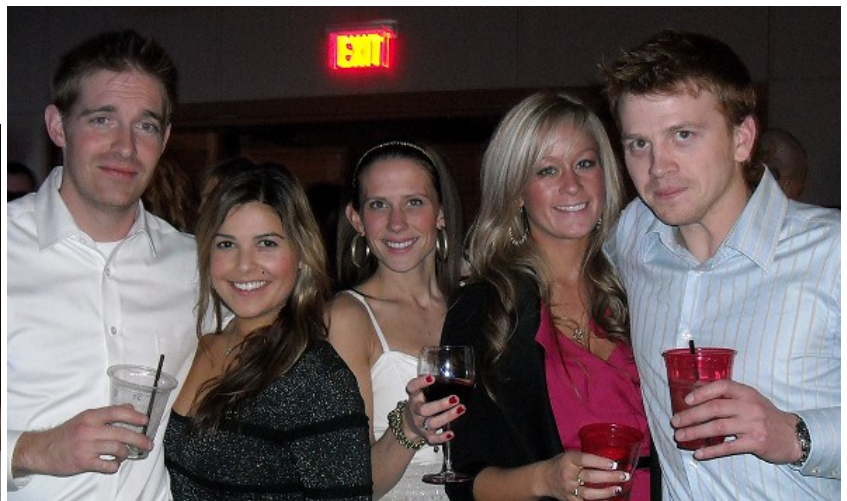
Employees past and present reunite for the party.