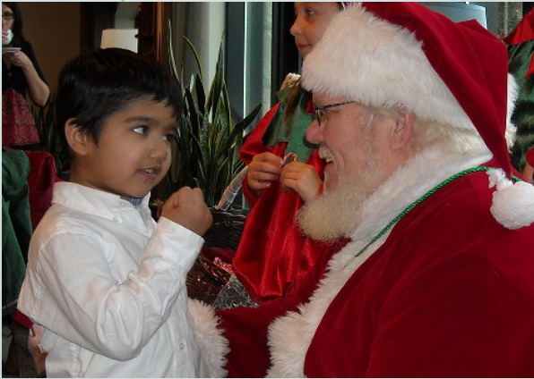
Looks like Santa might need security!