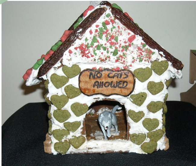
Ellen Phillipson from Housekeeping created this unique dog house from many delectable doggie treats!