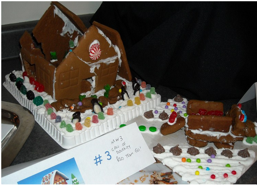
Ryan Leblanc from Banquets ran into a bit of a mishap but was able to turn it around by creating this scene from MW3 - Call of "Doughty" Red Gummies vs Green Gummies. Well done Ryan!