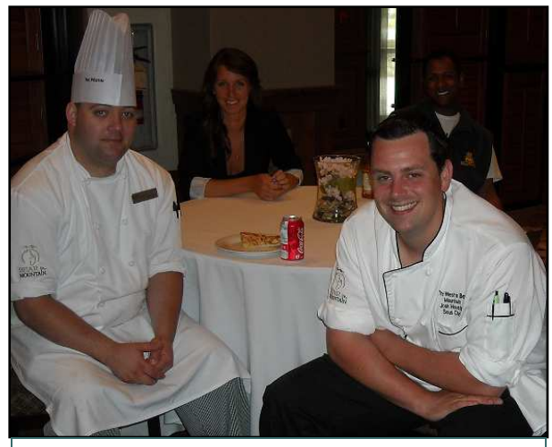
Not very often you see the kitchen crew sitting down, they should try it more often!