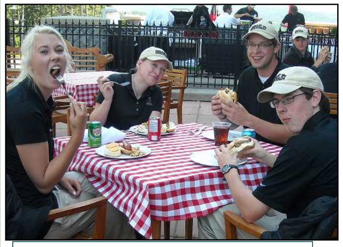
Members of our Greens Crew enjoy a much needed break in the shade!