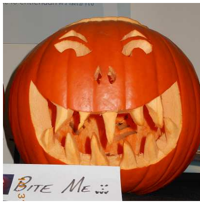
"Bite Me" Greens Department