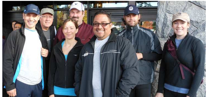
Above left & right: Associates from many different departments meet in front of the hotel before heading out!