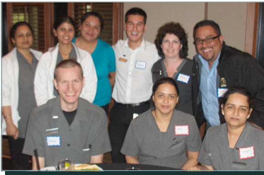
Some of our Housekeeping Team: