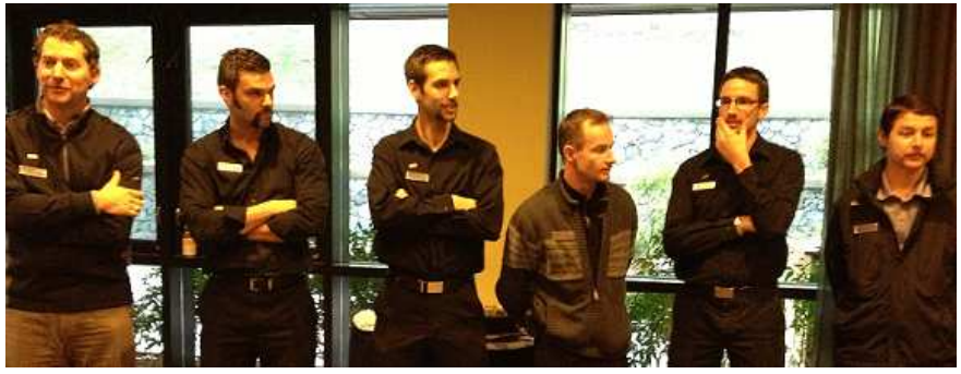
Some of our participants wait for the voting results! What a line up!