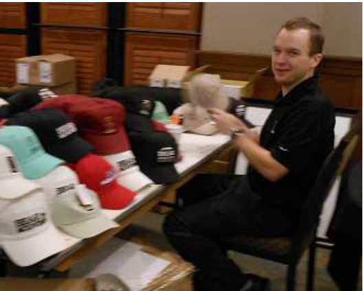
A different look for the ballroom!