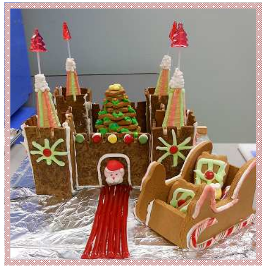
<u>SANTA'S FORTRESS</u> - by Carmen Parry—F&B.