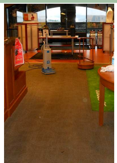
Where did everything go?