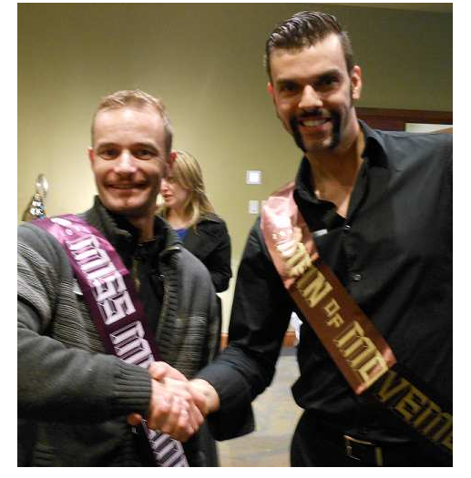
This years winners congratulate each other!