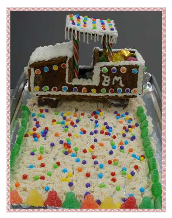
BEAR MOUNTAIN MAINTENANCE CARRY-ALL - Bryce Sophonow -Building Maintenance