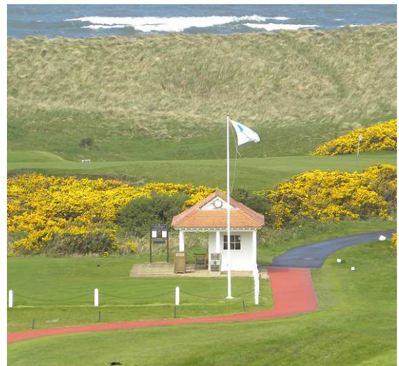
Looks like they have the same broom problem we have on our course!