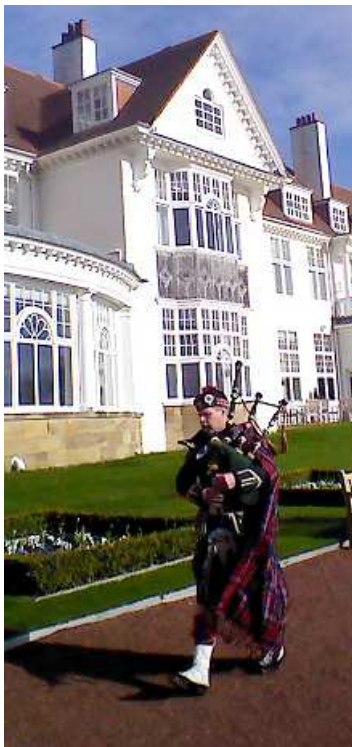
A well known ritual at Turnberry is the bagpiper who marches in front of the hotel every evening, rain or shine!