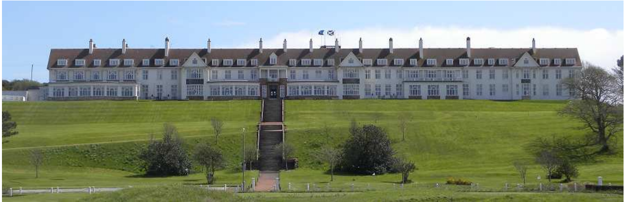
This impressive hotel is 107 years old!