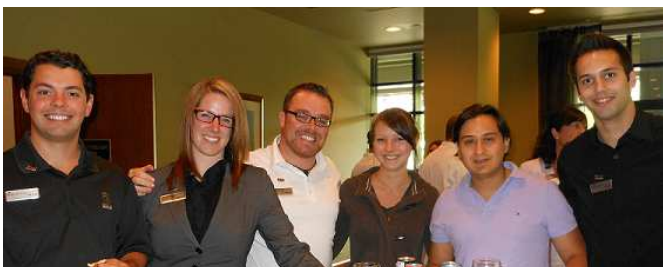
Above and left: