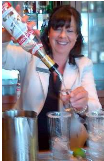
Left: We would like to introduce you to our newest "bartender". She is only working on-call when needed. But she looks to be settling in quite nicely! We really hope it works out!