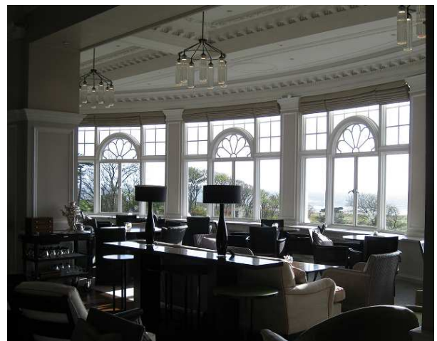
The library bar with stunning views.

For those of you wondering, Turnberry is a member of Starwood's Luxury Collection® portfolio.