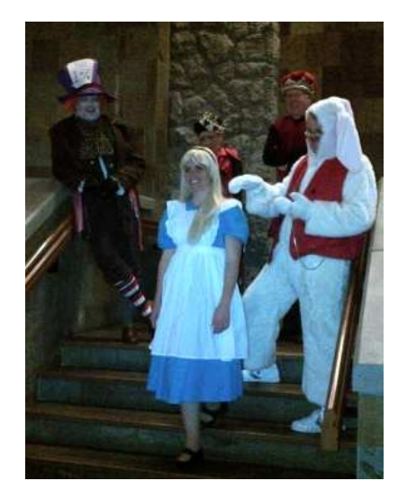
Alice in Wonderland!