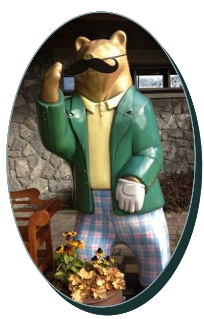
MOUSTACHE JACK! Looks like Jack the Bear is participating in "Movember on the Mountain"

What a beautiful way to start their lives together.